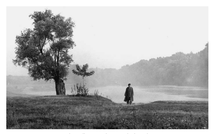
The Willow Tree (Der Weidenbaum)

plodding through the sublime countryside - and the inertia of big city bureaucrats who couldn't care less.