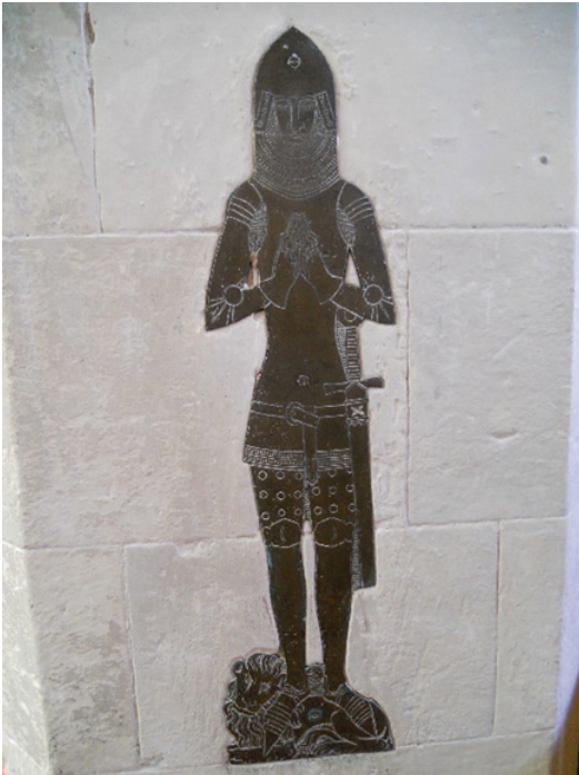
A mediaeval knight in armour

You have entered the dungeons of Castle Eltz. Imagine that one of the suits of armour starts to speak to you. It once belonged to the famous knight Wolfram von Eschenbach, the author of the German romance novel Parzival .