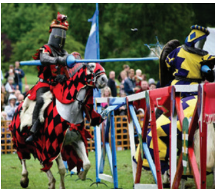
Jousting Re-enactment (Illustration) - World History Encyclopedia

Cavaleiro Medieval - Enciclopédia da História Mundial (worldhistory.org)