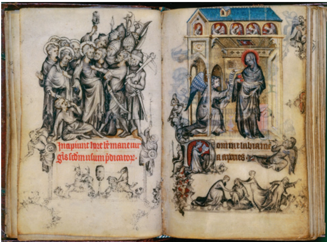
Book of Hours of Jeanne d'Evreux (Illustration) - World History Encyclopedia

Cultura e religião no Portugal medieval - Infopédia (infopedia.pt)