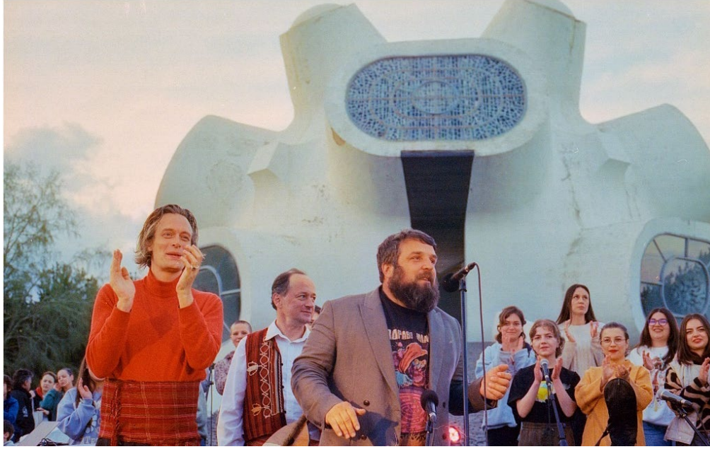
The Makedonium Band in front of the Makedonium monument in Kruševo, North Macedonia.