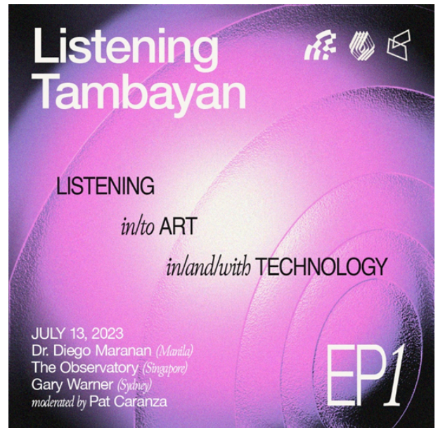
Event poster.