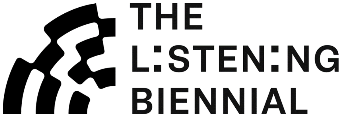
TLB 2023 logo. Image from the TLB 2023 Asia

This July and August, the UP Diliman (UPD) Office of the Chancellor will host The Listening Biennial 2023 (TLB 2023) with the theme Listening to/as Connection . The event that is co-sponsored by the UPD College of Fine Arts (CFA), UPD College of Mass Communication (CMC), Goethe-Institut Philippines, and Japan Foundation Manila, was launched on July 6 and will run until Aug. 8.