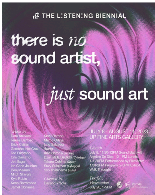
Event poster. Image from TLB 2023 Asia