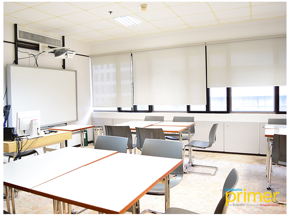
Classroom setting of Goethe-Institut Philippinen

Goethe Institut offers six-course language and exams divided into three levels: