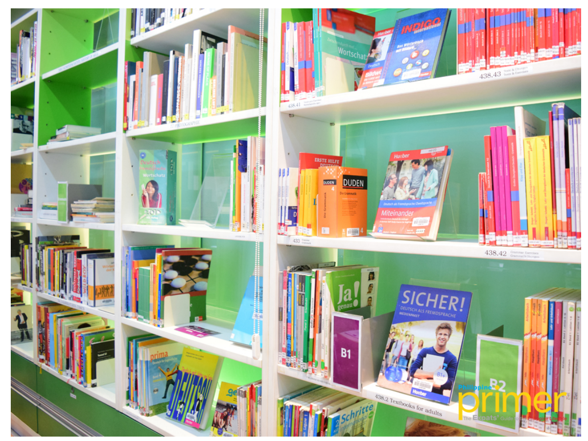
Educational German textbooks inside the Goethe-Institut Library

For those who are eager to learn the language in a shorter time frame, Goethe Institut also offers extensive, intensive, and super intensive courses where you can attend classes regularly, trimming down the standard course into an 8-11 week class depending on your level. For a complete list of schedule and prices, you may view it <a href="here">here</a>.