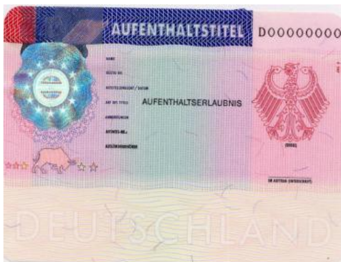
This is a sample of a residence permit.