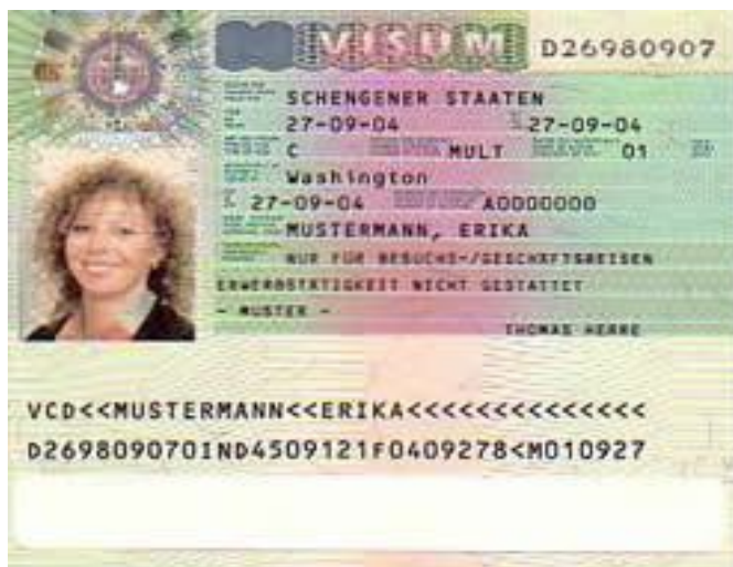
This is a sample of a student visa.