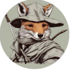
Robin des Bois