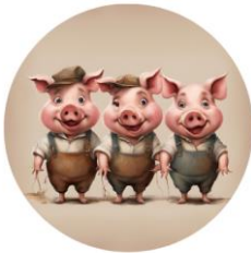
Les 3 petits cochons

Dragon – Cochon – Princesse – Reine – Sorcière – Loup – Chevalier – Ogre – Chat Botté – Grenouille – Prince – Génie – Magicien – Renard