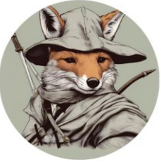
Robin des Bois