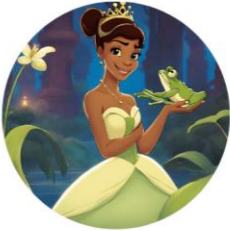
La princesse à la grenouille