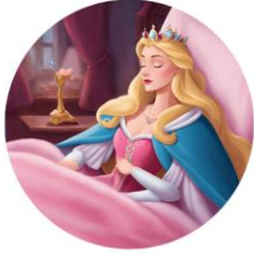
La Belle au Bois Dormant