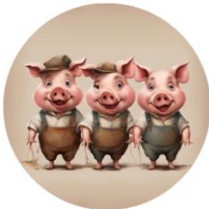
Les 3 petits cochons

Dragon – Cochon – Princesse – Reine – Sorcière – Loup – Chevalier – Ogre – Chat Botté – Grenouille – Prince – Génie – Magicien – Renard