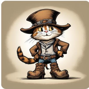
Le chat botté