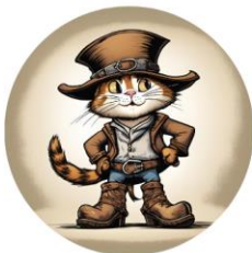
Le chat botté