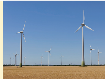
RENEWABLE ENERGY: FELDHEIM