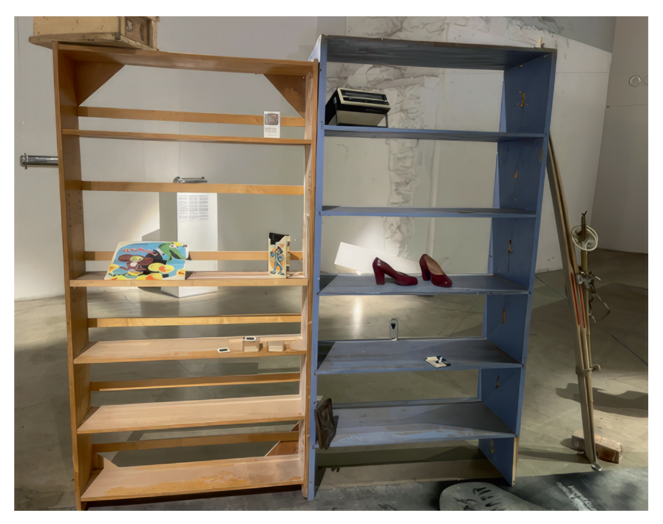
Installation of things found in the cellars of Ida-Virumaa.