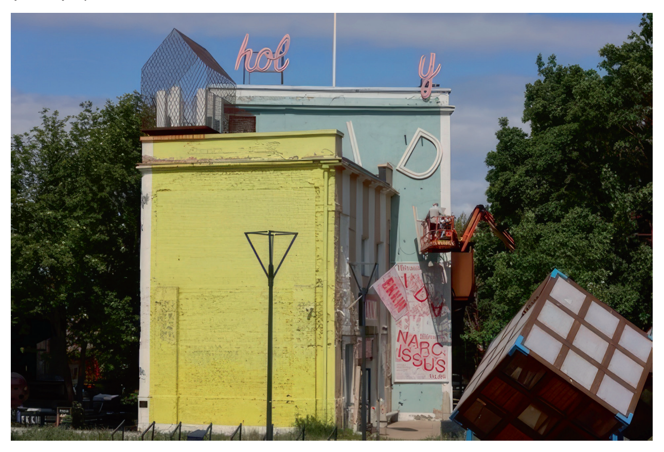
Sign IDA ("East" in Estonian), a part of a previous art show, was taken down from the roof of the EKKM museum building as a way of saying goodbye to the New East movement in June 2023.

The opening exhibition of the 17th season of the Contemporary Art Museum of Estonia (EKKM) April-June 2023